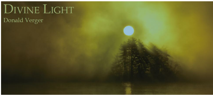
Image: Spirit, -32 Degrees , Thompson Lake, Maine, December 18, 2004