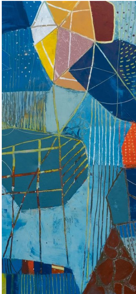
Held Together by String , oil on canvas, 2019

tried and true path of conferred Art degrees but, perhaps more importantly, has woven a tapestry of life experiences that certainly informs his work.