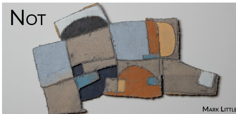
Not a Chance , oil, acrylic, and graphite on custom panel

First Friday Art Walk: February 7, 2020 5pm-8pm